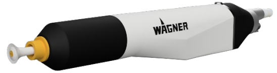
PEA-X1: Powder Gun with Deflector Cone

AMCOL is refining the 3500 Electrostatic Powder Application System. The new PEA-X1 Powder Gun will replace the obsolete PEA-C4 and C3 version. The PEA-X1 will be a drop-in replacement with a retrofit kit. The improved design allows for less powder accumulation inside the gun, reducing clogging. Ease of cleaning and maintenance has also been improved.