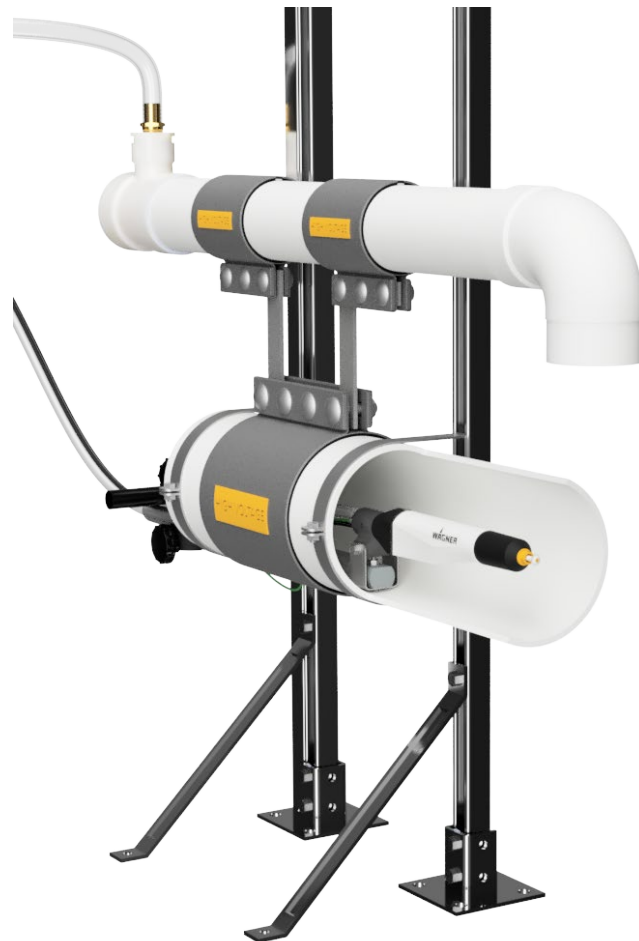
PEA-X1 shown on 3500F System